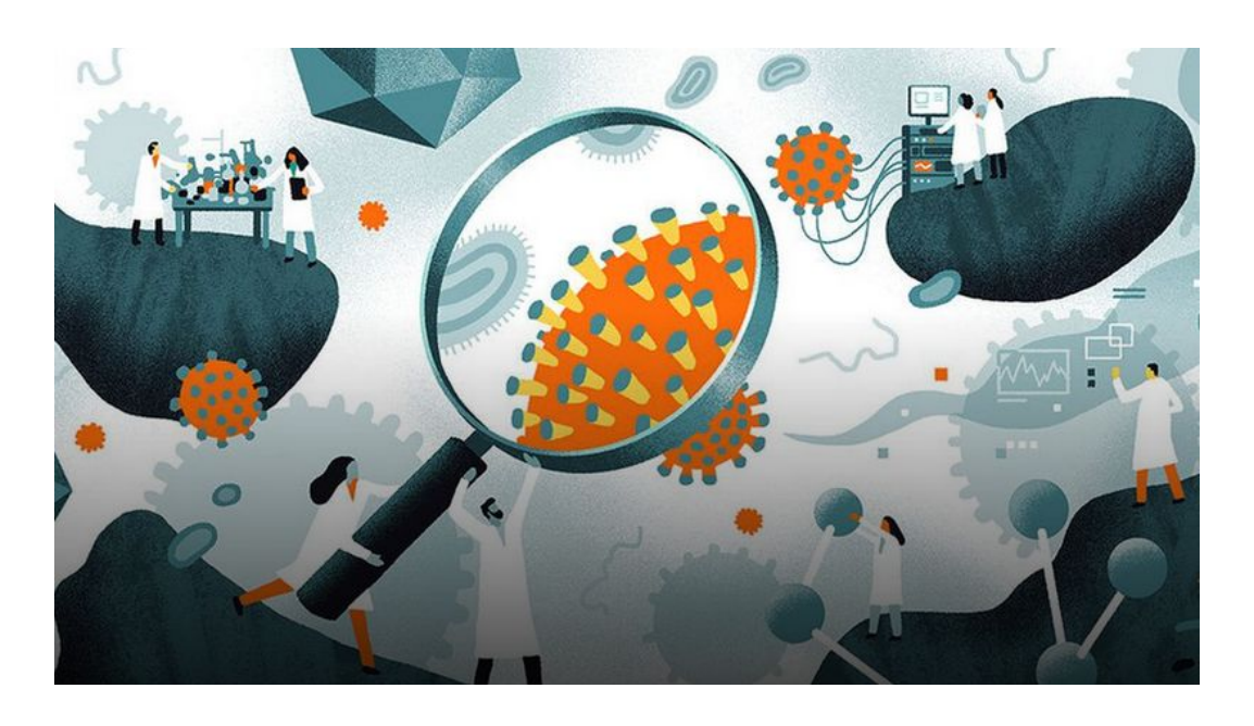
Caltech Conversations on Covid-19: Why Masks Work