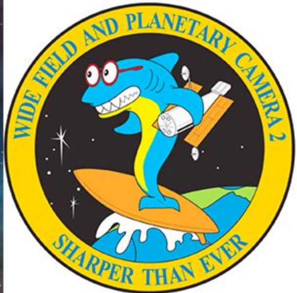
(Left) The iconic Pillars of Creation photograph taken by the Hubble Space Telescope in 1995 (Right) The shark logo used during the early team planning of WFPC2