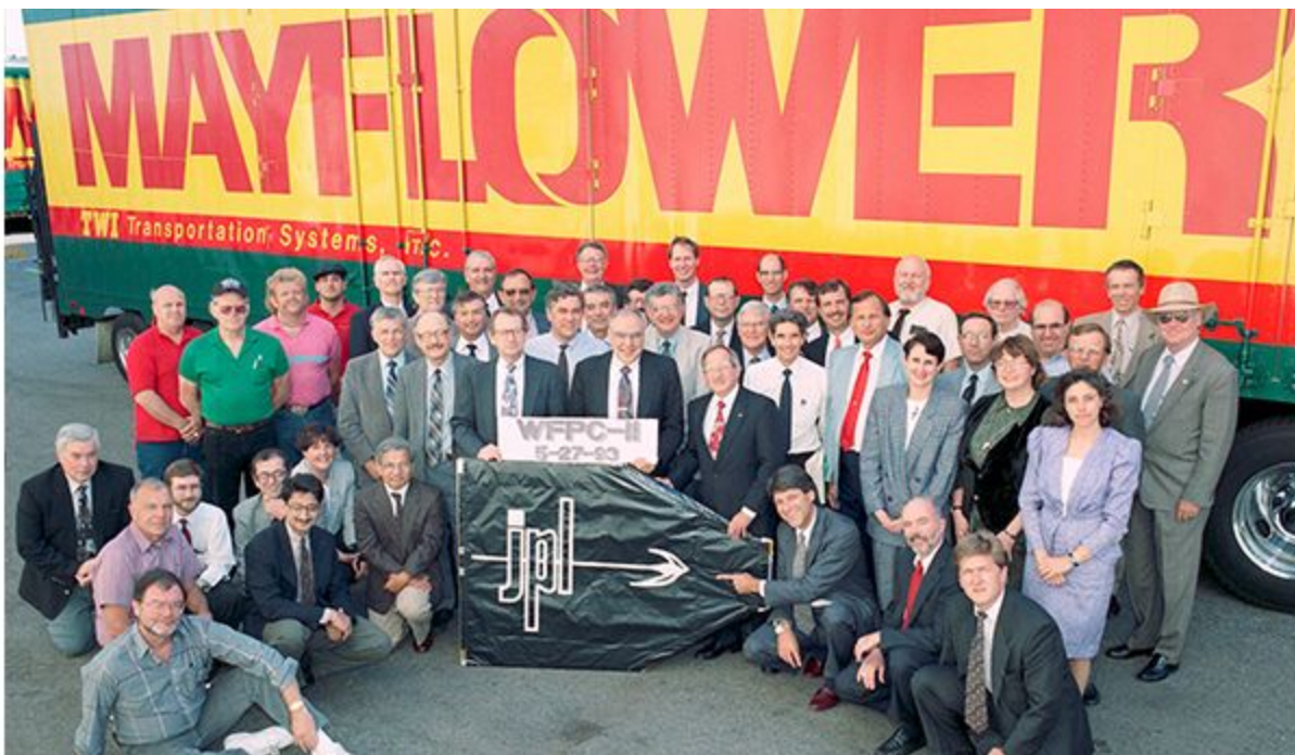
Shipping day for WFPC2

The Hubble project was unique for a center specialized in robotic exploration. At the end of the job, a person had to plug it in.