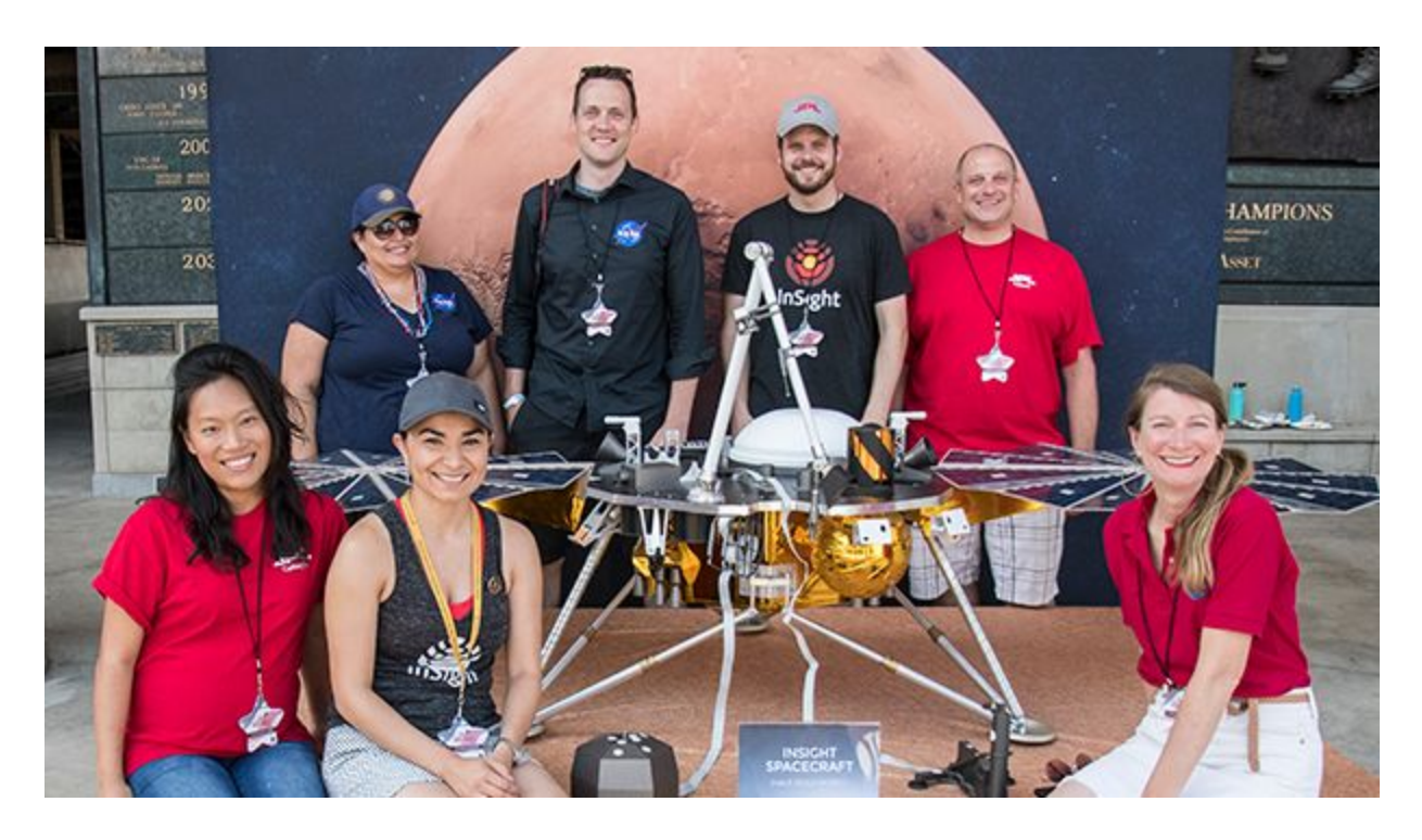
The Mars public engagement team at the Rose Bowl, with a model of the InSight lander.

This was the third year JPL has collaborated with the Americafest celebration at the Rose Bowl, now in its 92nd year. Last year, the JPL exhibit celebrated the 20th anniversary of the Mars Pathfinder rover landing, and in 2016, JPL's public engagement team highlighted the Juno satellite's Jupiter orbit insertion.