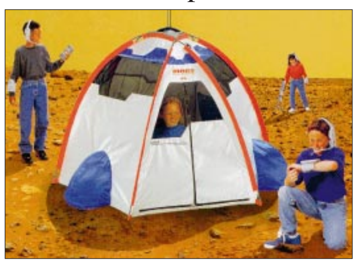
Through JPL's Technology Affiliates Program, Uncle Milton Industries Inc. has developed the "Mars and Beyond Science Exploration System," a new toy line developed in collaboration with JPL engineers and scientists.