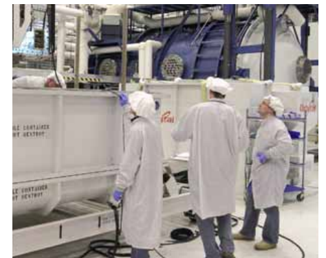
Clockwise from top: the JPL NuSTAR team; the NuSTAR spacecraft being lowered into its shipping container at Orbital Sciences Corp. in Dulles, Va. in January; engineers in the final stages of assembling the satellite at Orbital Sciences.