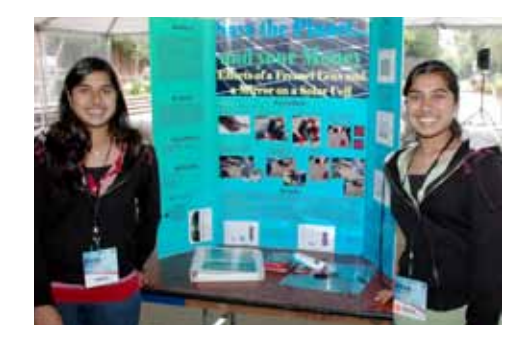
Students display their project at the science fair.