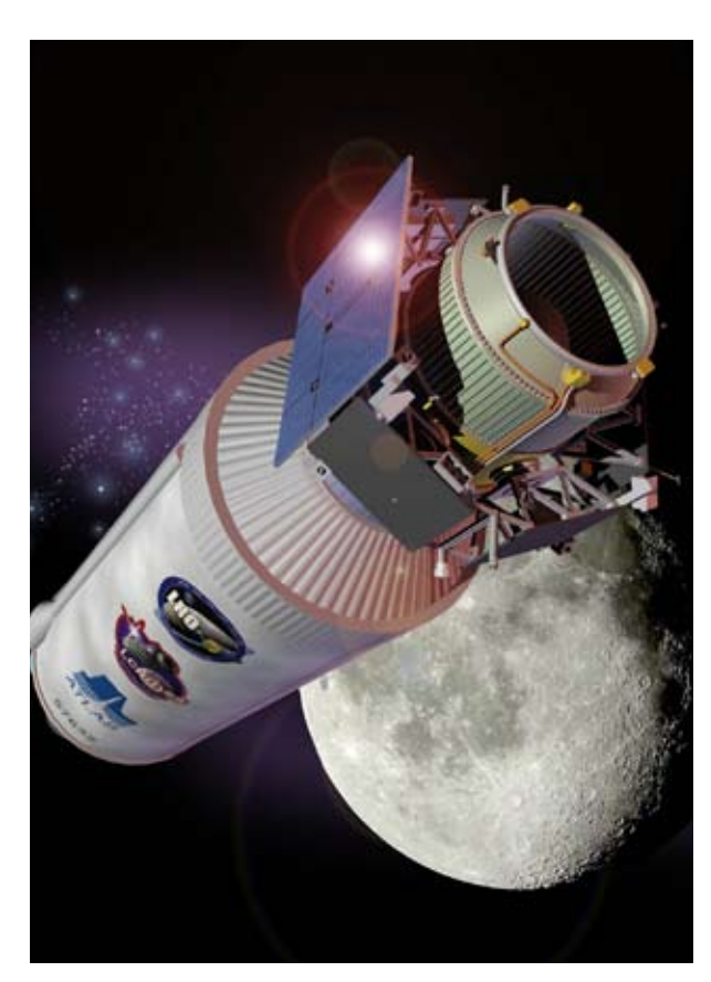
Artist's rendition of Centaur upper stage rocket approaching the moon with the Lunar Crater Observation and Sensing Satellite.

JPL has played a key role in what NASA has termed "a smashing success" in the search for water ice on the moon.