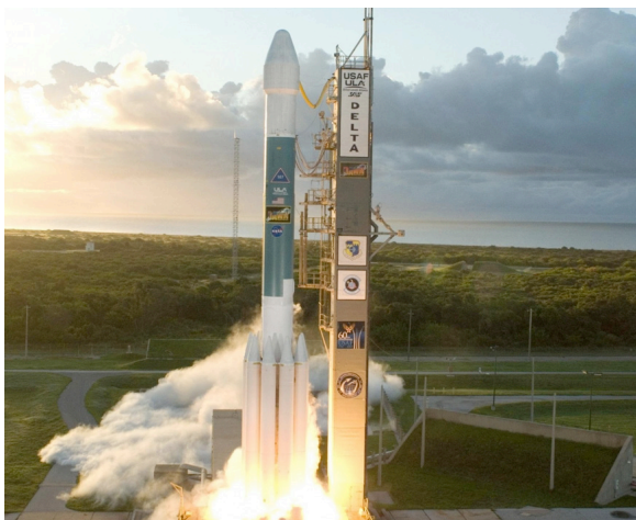
The ELaNa X CubeSats will launch aboard a Delta II rocket as auxiliary payloads on the Soil Moisture Active Passive (SMAP) mission.

The CubeSat Launch Initiative (CSLI) enables the launch of CubeSat projects designed, built and operated by students, teachers and faculty to obtain hands-on flight hardware development experience. CSLI also provides access to space for CubeSats developed by the U.S. government and non-profit organizations giving all these CubeSat developers access to a low-cost pathway to conduct research in the areas of science, exploration, technology development, education or operations. Since its inception in 2010, the initiative has selected more than 100 CubeSats from primarily educational and government institutions around the U.S. These miniature satellites were chosen from a prioritized queue established through a shortlisting process from proposers that responded to public announcements on NASA's CubeSat Launch Initiative. NASA will announce another call for proposals in early- to mid-August 2015.